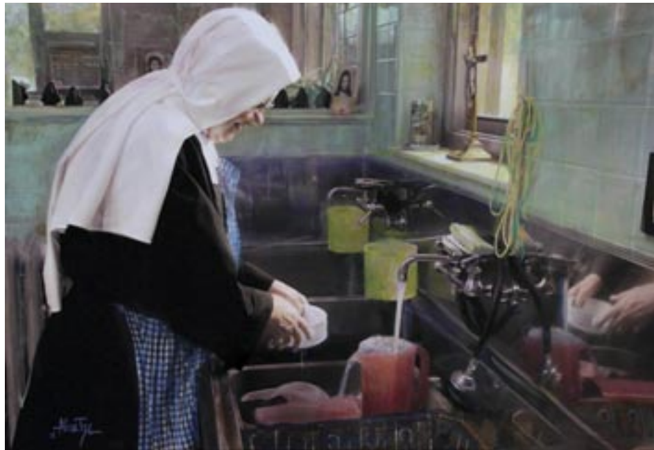
Above: 'Washing Dishes' by Anne Goetze. Archival pigment ink, oil, 2019