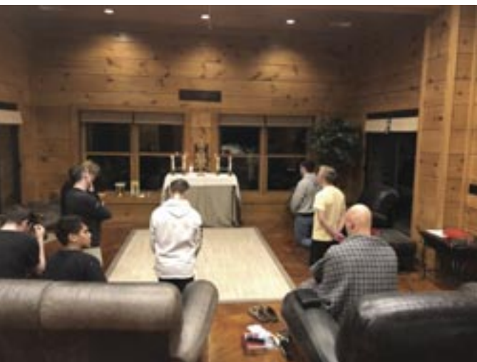
Above: Autumn Melchizedek Project discernment retreatants attend all-night Eucharistic Adoration.