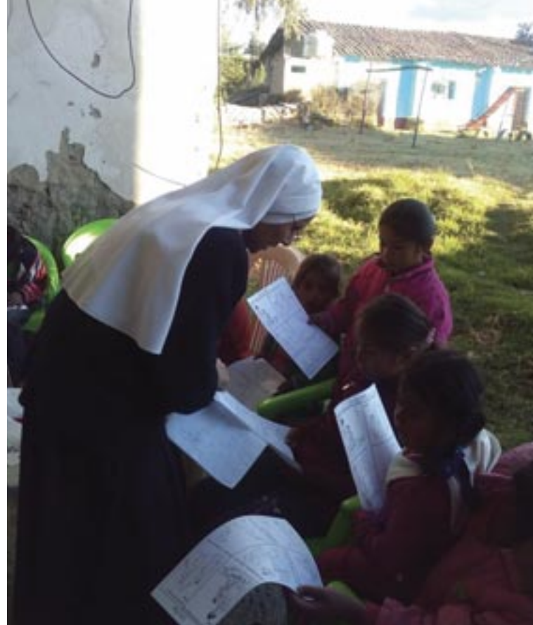
Above: Catechesis in Quechua with children.