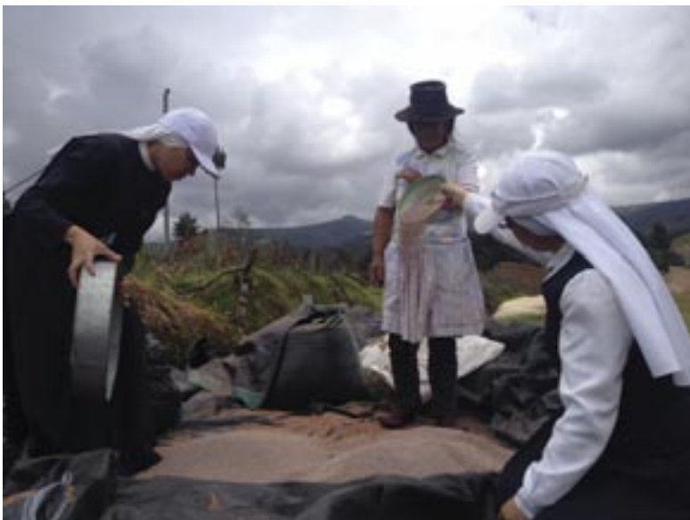
Below: Servants of the Plan of God sisters minister to the most remote mountain villages of Ayaviri (left). They also provide education on hygiene and nutrition (right).